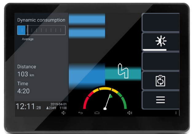
A screen-based interface provides detailed feedback.