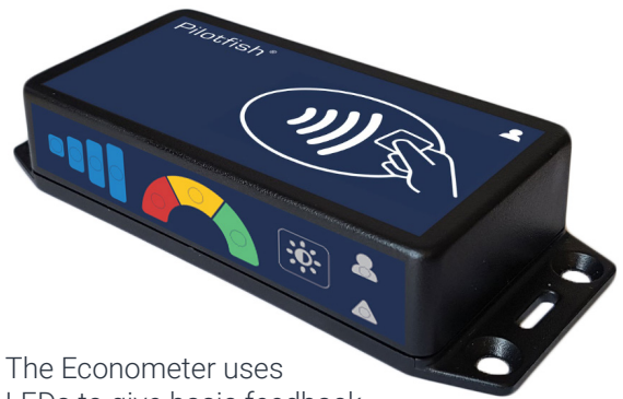
The Econometer uses LEDs to give basic feedback.